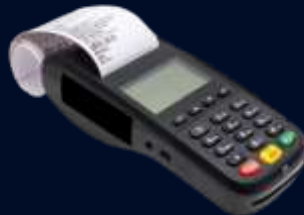
Titan payment Pay