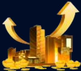
Titan Real Estate